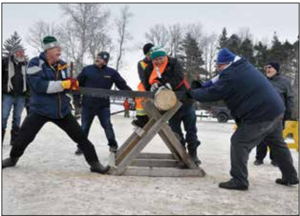
Clockwise from top left: Creemore Nights; Copper Kettle Festival; Creemore Festival of the Arts; TNY Hunt Horse and Hounds parade; Easter Egg Hunt; GNE fall fair; Winterama; Canada Day (inset).