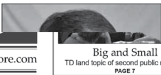
Big and Small TD land topic of second public meeting

by Trina Berlo Clearview Township is included in a government review of municipalities.