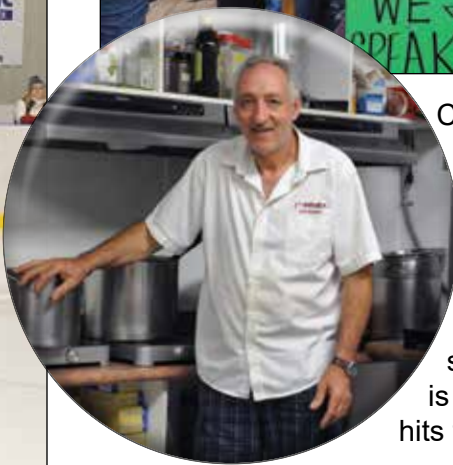
Clockwise from top left: CLEAN's plastic sculpture during Creemore Festival of the Arts; Climate strike action; taking refuge from a snow storm in Singhampton; A proposal at the Stayner Habitat for Humanity house dedication; Pride flag raising at Clearview's emergency hub; Sarah Richardson's second show about Creemore airs; the old school bell is installed at NCPS; Clearview Minor Hockey hits the ice; Locals suffer Roxodus fallout (inset).