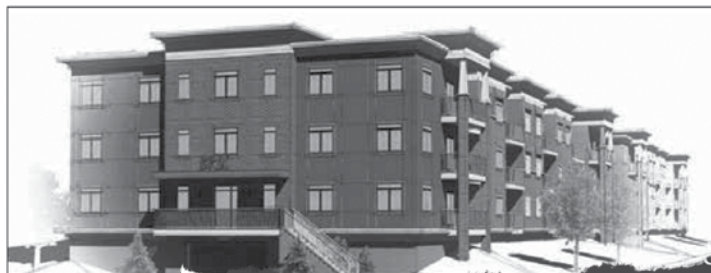
The Brix may be marketed as The Brix works since 2018.

MDM Developments describes it as (See "Developers" on page 2)