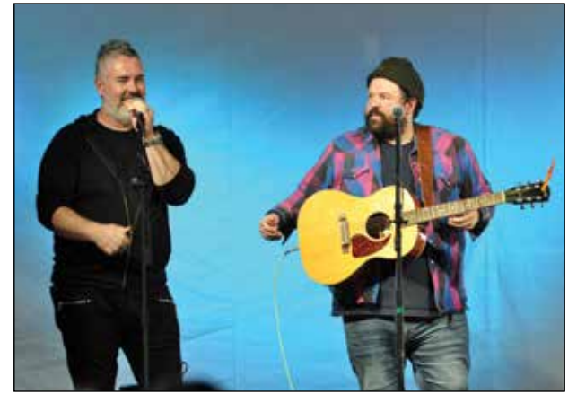
Clockwise from above: Sunnidale Winterama went off without a hitch from Jan 30 to Feb. 2; Donovan Woods welcomed special guest Ed Robertson of The Barenaked Ladies to Avening Hall on March 7; the curling season was well underway; House of Stitches went to work supporting wildlife rescue efforts associated with wildfires in Australia; The demolition of the TD Bank.