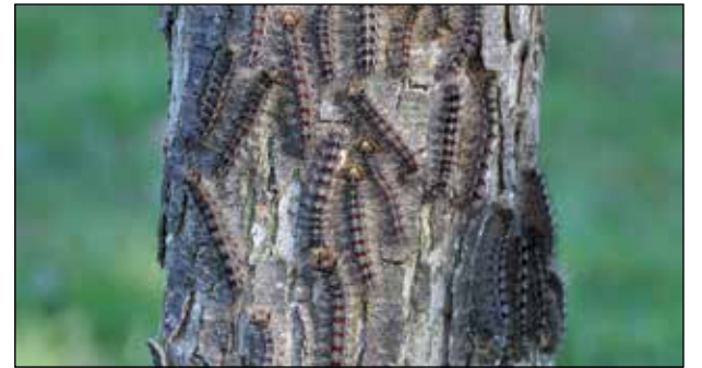
Clockwise from left: Rabbie Burns Day at Pizza Perfect with haggis pizza; Mulmur's Morningcall Farm welcomes twin calves; A gypsy moth caterpillar invasion; The Big Heart Food Box program launches; the Leimgardts mark the 75th anniversary of the liberation of Holland in 1945; A surprise visit from Beaker on Halloween.