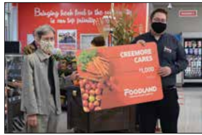
Caring Community Village shows its big heart in 2020 PAGE 3