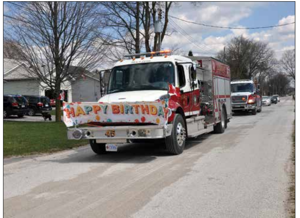
Clockwise from above: In May, residents paraded around town in their antique cars and tractors to give the community some entertainment; the fire department answered the call for birthday drive-bys for people of all ages; A Canada Day parade in Stayner went by the nursing homes as a salute to residents and staff; A parade was organized in April to show support for residents and staff at Creedan Valley Care Community.