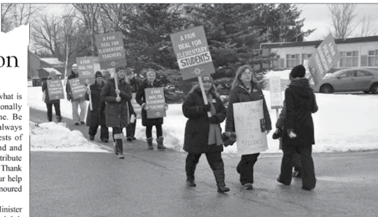
Niagara and Creemore Public School staff joined colleagues at New Lowell Elementary School on the picket line during the first full day rotating strike.

Creemore educators joined forces with those at New Lowell Central and other schools in the region, including the mayor's office, to support Monday during a full day strike.