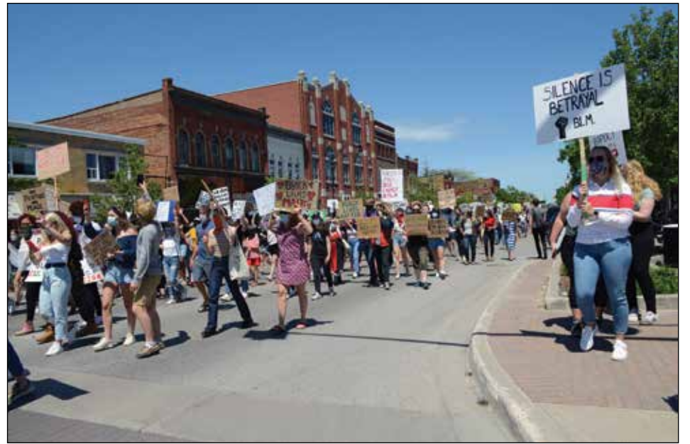
Clockwise from above: Protesters took to the streets of Collingwood in June in support of Black Lives Matter; teachers from all provincial unions held a series of one-day strikes during contract negotiations; A group of residents protesting the expansion of accommodations at Mansfield Ski Club; Jean Vanier students held a rally in June in support of re-naming Jean Vanier Catholic High School, Our Lady of the Bay; A vigil was held in April for the victims of a shooting in Nova Scotia.